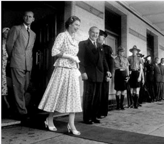
The Queen and Prince Philip leaving the Gollan Hotel, Lismore in 1954.

Naval Officer, husband, father, grandfather and great grandfather. He will leave a void in many lives. During his lifetime he had supported 992 charities and was an early conservationist, being President of the World Wildlife Fund 1981 – 1996. He had a strong affinity with Australia and visited the Northern Rivers on many occasions. Despite suffering trauma in his early life, he had a positive attitude and a great sense of humour. Some of his sayings: - 'I just had to get on with it', 'You do', 'One does'. The Queen and Duke visited the Northern Rivers in February 1954 and stayed at the Gollan Hotel in Lismore. Many locals came out to view the young couple and new Queen. They left just before one of the worst floods to ever affect the area arrived.